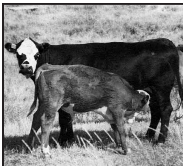
Farm managers learn from last year's decisions and plan for the future.

ting any new animals is necessary. Secondly, vaccinate for disease that can cause decreased fertility. And third, monitor diseases that decrease the pregnancy rate. All animals introduced in the herd should be quarantined for