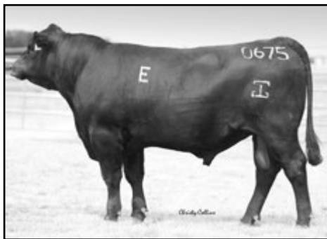
GAR Solution E0675—Solution is one of the greatest sires in the history of GAR! E0675 could be one of his best sons ever!