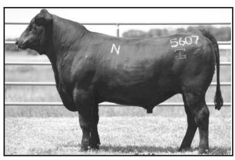
LOT 2 • GAR OBJECTIVE N5607• BD: 6/14/07

N6217 quite simply equates to multi-trait opportunity. He ranks in the top 1% of the breed for VW, YW, Milk, SW, SF, and SB. Simultaneously, he ranks in the top 10% of the breed for CED, and the top 2% for Marbling, and RE. The bottom line is that this bull is one of the best prospects in our history.