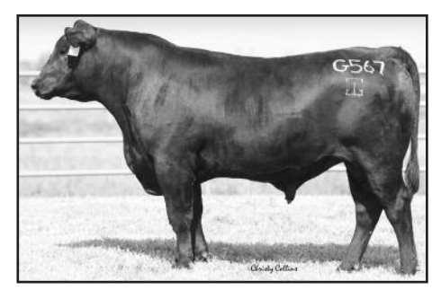
LOT 5 • GAR PREDESTINED G567 • BD: 3/27/07 GAR Predestined X GAR Precision 183