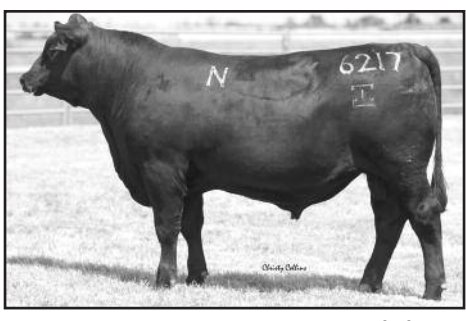
LOT 1 • GAR OBJECTIVE N6217• BD: 7/2/07

SS Objective T510 OT26 X GAR 1407 New Design 653