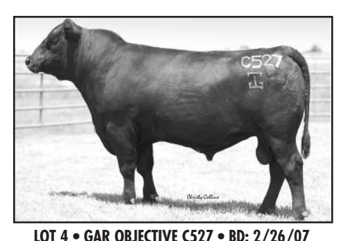
LUI 4 • GAR UBJECTIVE C52/ • BD: 2/26/U/

The bulls that sell in our 2008 fall sale represent a total A.I. program with no clean-up bulls since 1964. We have only used progeny proven bulls in GAR sire selection since the very first sire summary was published in the fall of 1980. We use a great deal of discipline