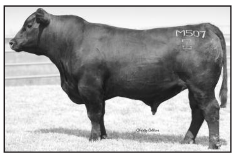
LOT 9 • GAR 5050 NEW DESIGN M507 • BD: 1/9/07 GAR New Design 5050 X GAR Precision A461

These EPDs are a good example of how our "pounds in the correct package" selection process is working. It is interesting to note that the AVERAGE BULL IN THIS SALE ranks in the top 15% of the Angus breed for direct calving