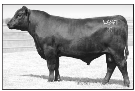
LOT 6 • GAR PREDESTINED L647 • BD: 3/22/07 GAR Predestined X GAR Precision 1193

Their start weight was 842 pounds and out weight was 1208 pounds. The average daily gain on the 159 bulls was 4.35 lbs/day. Since May 28, all of these bulls except the "N" bulls have been running in section or larger pas-