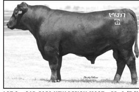
LOT 3 • GAR 5050 NEW DESIGN M097 • BD: 1/7/07

+68.93~SB = Sweet performance! Breed leading growth and value in a moderate BW package.