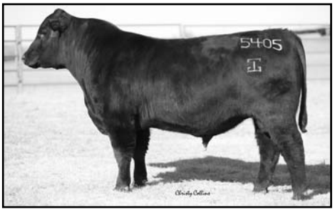
LOT 5 • GAR RETAIL PRODUCT 5405