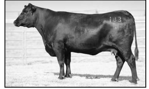
LOT 477 • GAR PRECISION 183

Power, Presence, and Prepotency. This Predestined son will sire muscle pounds. One of the real studs of this sale.