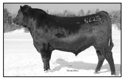
LOT 1 • GAR SELECTIVE