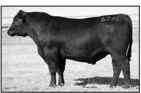
LOT 7 • GAR PREDESTINED 6735

2536 is considered by many to be one of the good cows in Angus history. Her grandson helps show why.