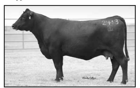
LOT 476 • GAR 1407 NEW DESIGN 2413

S115 bull is stunning in his eye appeal combined with breed leading genetic merit.