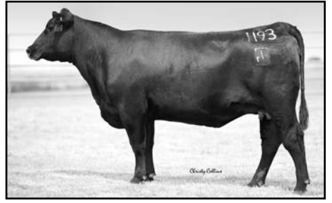
LOT 480 • GAR PRECISION 1193

bulls to sire similar efficient traits in their offspring. The great news of the Angus breed is that we are able to select for fast-growing cattle, while simultaneously selecting for superior carcass traits. This year's bulls have a %IMF EPD of +.44, a RE EPD of +.51. The average bull in this sale recorded a 14.32" REA. This places the sale bulls in the TOP 5% of the breed for %IMF and the top 12% of the breed