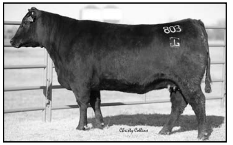
LOT 479 • GAR 1407 NEW DESIGN 803

803 is the dam of our lot 1 bull this year G A R Selective. His performance speaks for itself and is a shining example of 803's ability. She is a daughter of G A R Precision 1639, the # 16 cow of the Angus breed for RE.