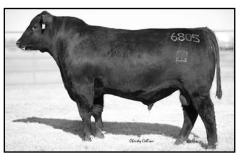
LOT 3 • GAR OBJECTIVE 6805

Perspective has one of the highest $Beef values in the history of GAR. In fact Perspective is the 7th ranked $B non-parent bull of the entire breed. No surprise as he is a double bred Precision back to 2536 on his maternal side. His potential is very interesting.