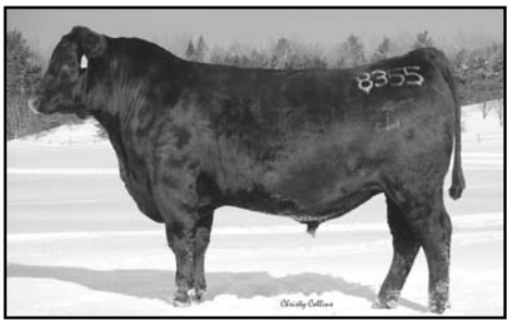
LOT 2 • GAR PERSPECTIVE

We believe it is interesting and important to note that the AVERAGE EPDs of the 475 bulls offered in the sale are: CED +8 BW +1.9 WW +48 YW +92 YH +.3 Sc +.04 Milk +27 CEM +9 $EN -2.24 %IMF +.44 RE +.51 Fat +.01 $W +27.66 $F 34.04 $G +24.33 and $B