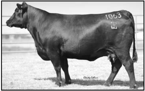
LOT 478 • GAR 1407 NEW DESIGN 1063

183 is the dam of G A R Objective 2445 who ranks as the 5th highest $Beef Index female in the U.S. We believe that 183 is the best proven daughter of G A R New Design 1440 to date. 183 is truly an elite donor.