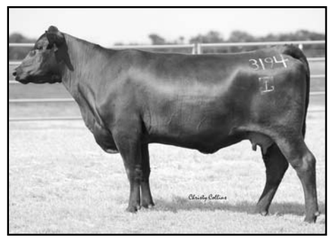
LOT 446 • GAR FUTURE DIRECTION 3194

Each year since our first production sale in 1980, we have sold 25% of our cow herd. Some producers call this a mature cow herd dispersal. We prefer to call it a production sale. Our total AI program, without the use of cleanup bulls, is our assurance that you will be able to select daughters of the very best bulls in the Angus breed. We are proud of these females