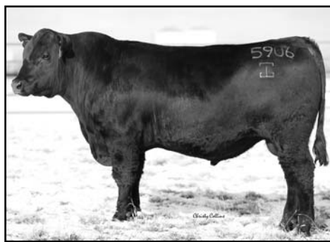
LOT 1 • GAR REMEDY