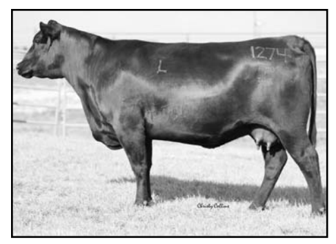
LOT 445 • GAR FUTURE DIRECTION L1274

CA Future Direction 5321 X GAR New Design 1440