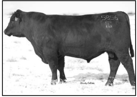
LOT 7 • GAR 111 RITO 5856

We encourage you to note the average EPDs of the 439 bulls offered in the sale: CED +9; BW +1.7; WW +49; YW +94; YH +.23; SC +.01; Milk +27; CEM +9; $EN -4.66; %IMF +.56; RE +.59; Fat +.01; $W +28.11; $F +34.52; $G +29.37 and $B +55.16. The average bull in the