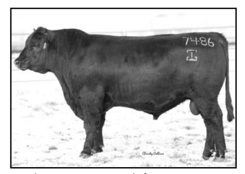
LOT 4 • GAR OBJECTIVE 7486

5496 is the #3 SBeef non-parent bull of the Angus breed. Note the incredible muscle he displays. He recorded an 18.6" ADJ REA. His dam G A R Precision 404 is a maternal sister to Solution, and she sells with the donors as Lot 443. 5496 is the type of bull that helped make the Angus breed what it is today.