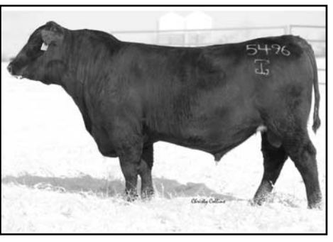
LOT 2 • GAR OBJECTIVE 5496

We are particularly pleased to present our 29th Annual Production Sale offering. Three years ago, we began having a fall bull sale. The implementation of another sale afforded us an opportunity to critically analyze the data on all of our cattle at least twice annually. When you study the data and compare to the fall or spring