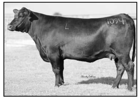
LOT 441 • GAR 1407 NEW DESIGN L1094

This strapping 1i1 son combines the power of his sire with one of the good donors from GAR. Note the elite ranking for WW, YW, %IMF, RE, SF, SG, and SB.