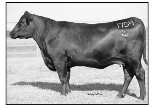
LOT 447 • GAR FUTURE DIRECTION 1754

Embryo transfer has allowed us to accelerate our genetics, increase the quality and quantity of our herd, while simultaneously allowing us to sell females at a more youthful, useful age to our customers. This year we will sell 55 cows that have worked as GAR donors. We believe there is unique value within this group. Every year the GAR donors have gone on to make money for their new owners. Seeing these cows succeed across the U.S. is one of our greatest satisfactions. Our 2008 female offering will include 87 cows with heifer calves. These cows and calves, as always, will sell as a three-in-one unit. The 87 pairs represent some of the best "values" in this sale. These cows are all very young and their calves are sired by the best Angus bulls in the breed. Next we will sell 79 bred cows fol-