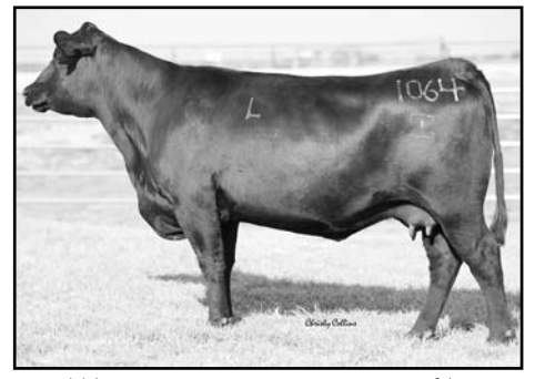
LOT 444 • GAR FUTURE DIRECTION L1064

L1094 demonstrated an even more impressive production record on her first calf sired by Objective, (the Lot 4 bull 7486) than her sister 2413. This cow is truly destined to be one of the elite cows in our history.