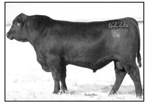
LOT 5 • GAR OBJECTIVE 6226

SS Objective T510 0T26 X GAR Load Up 1314