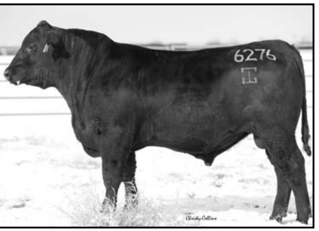
LOT 6 • GAR RETAIL PRODUCT 6276

The bulls, as always, represent a total AI program with no clean-up bulls since 1964. This year 263 head, or 60% of the bull offering, is the result of embryo transfer. The fall-born bulls were fed for 84 days at Beefland Feedyard and Triangle H Feedyard, Garden City, KS. Their start weight was 838 lbs. and out weight was 1263 lbs. The ADG was 5.06 lbs./day with an average dry matter feed conversion of 4.65 lbs.