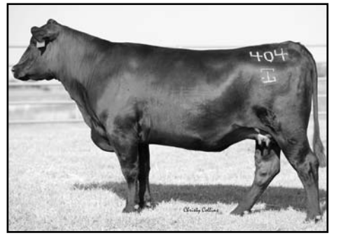
LOT 443 • GAR PRECISION 404 GAR Precision 1680 X GAR New Design 50

We frequently are asked when the next outlier like 2536 would emerge at GAR. We honestly don't know the next cow that will exhibit the decade long dominance of 2536 (common sense and genetic trends suggest it will never happen again). HOWEVER, we get quizzed for this prediction. That being said—this is the best candidate we have produced to date. Here she is...2345 will impact the Angus breed.