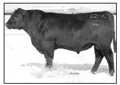
LOT 8 • GAR PREDESTINED 6206

6226 offers a sire and dam combination without Precision and New Design. As with most of our better cuttle, they are both right there with ND 80 as the dam of 1314 on back to 2536, but the point is this could be a super star bull that gives us a "skip step" as an outcross on all the good 036 and Precision cuttle. Big time potential to do this with 6226.